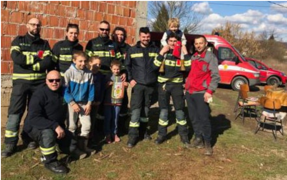
Visiting needy families with the Italian firefighters

A team of seven firefighters came from Rovereto (TN), Italy to spend a weekend at our volunteer center. They arrived in two official vehicles filled with 700 kg of food and school supplies and they joined us in our activities with enthusiasm and generosity.