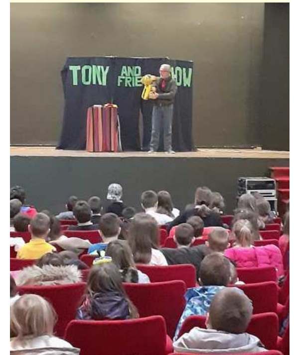
A show for children in Bihac, Bosnia

it was an unforgettable experience for all the volunteers, and although at a distance, we kept having weekly meetings on Zoom with various individuals we met at the camp, and we sent donations to them and the volunteers working there.