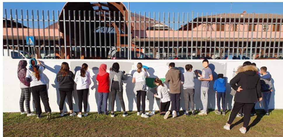
Painting a mural with the local youth group in Italy

Another activity was painting an outdoor mural on the wall by the playground of the youth parish house. Thankfully the weather was favorable to this project and we could work outside.