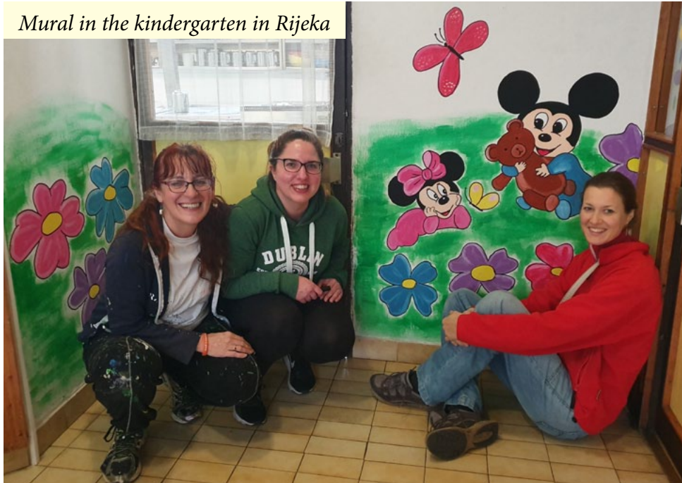
Mural in the kindergarten in Rijeka

We managed to paint a mural in a kindergarten “Kvarner” in Rijeka, after which the Covid-19 era started, meaning most of our projects and activities were cancelled and we were under lockdown for about two months.