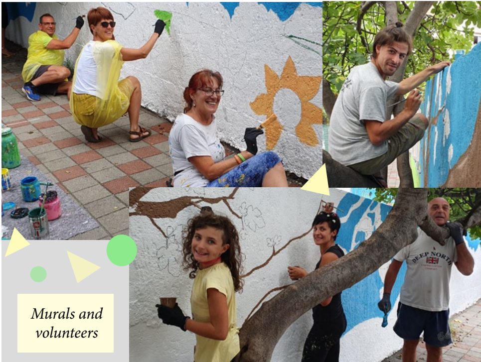
Murals and volunteers