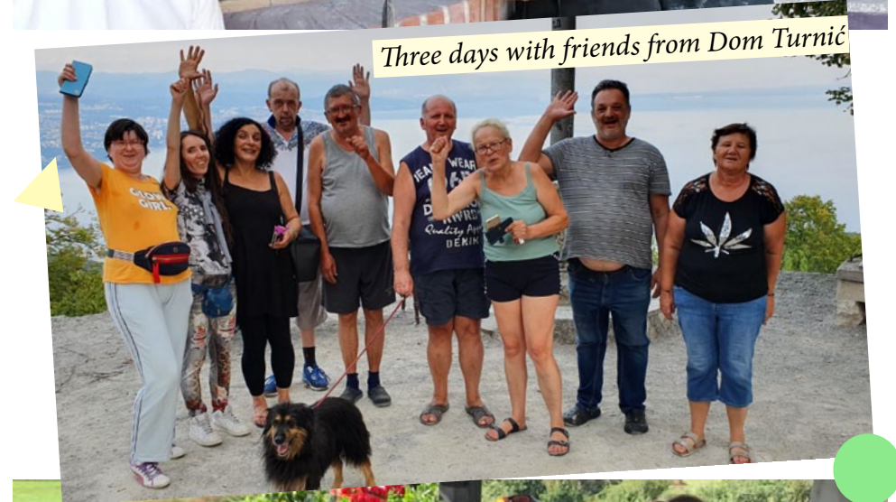
Three days with friends from Dom Turnić