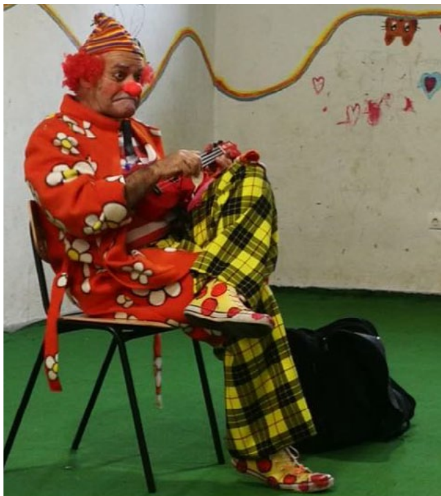
A show for children in the refugee camp

included: five meetings in the elementary school, each one 2 hours long with about 40 students in attendance, with whom we talked about volunteering, about how to change their part of the world, and about peace and solidarity. We also introduced and played the “Game of Hearts”.