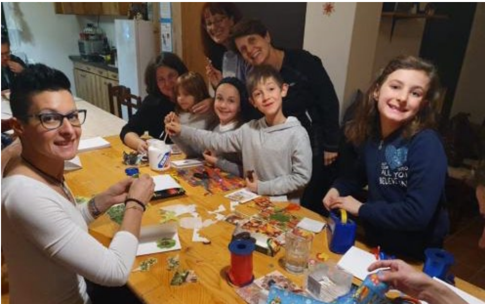
Children and moms preparing greeting cards

We spent the New Year's Day visiting families around Karlovac area, bringing them humanitarian aid packages and New Year's greetings.