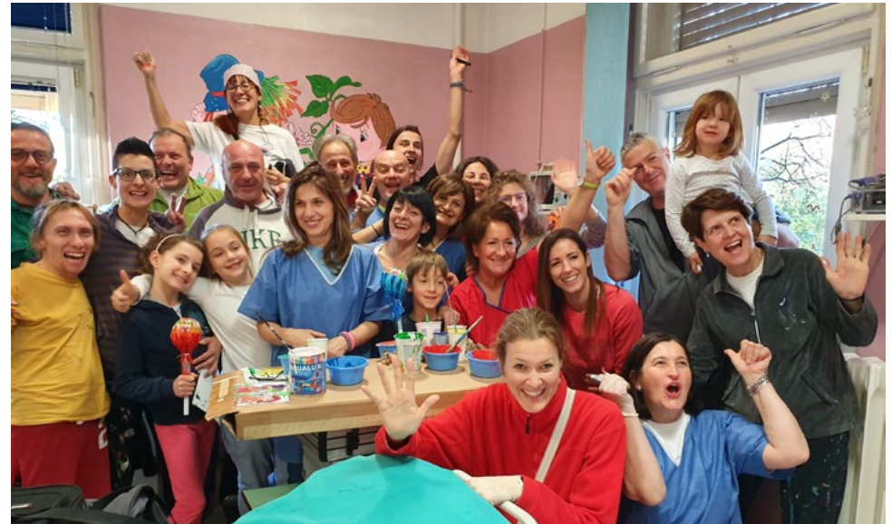
The team that painted a mural in children's hospital in Kantrida, Rijeka

The following two days, January 2 and 3, we painted several murals in the children's hospital in Kantrida (Rijeka) as part of a project called "Happy Walls". In these two days we painted the whole upper floor of the building.