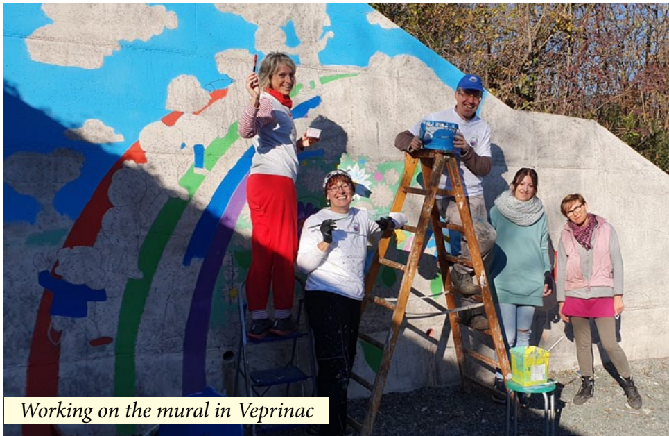
Working on the mural in Veprinac

Thanks to the good weather, we managed to paint a mural in the kids playground in Veprinac, a place where our center is located. After three days of work, joined by various volunteers, we managed to transform a big wall from a plain cement grey to a joyful play of colors. We will continue with painting the remaining wall in the spring.