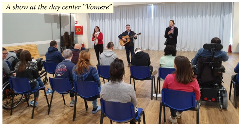
A show at the day center “Vomere”

One morning we visited a center for the disabled, called “Vomere” and improvised an animation with songs, and our legendary skit of the Good Samaritan. The actors were the beneficiaries of the center, and their version of the skit was one of the most original ones that we’ve ever seen!