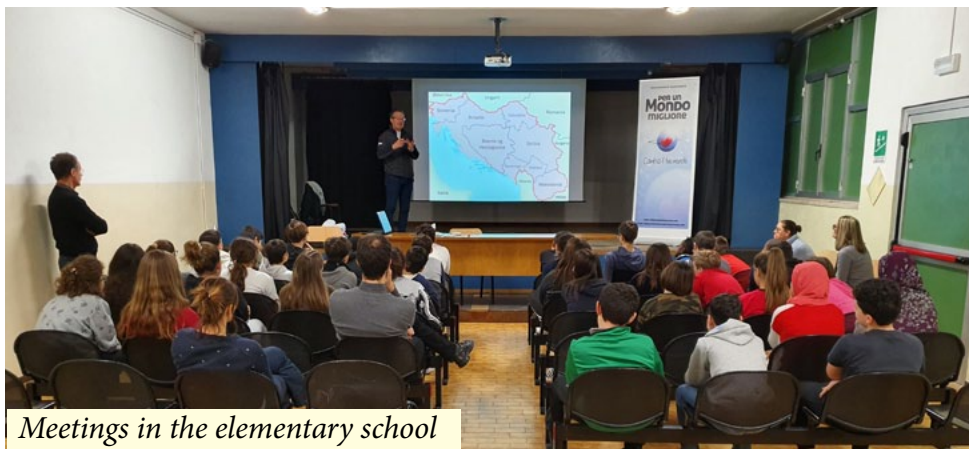
Meetings in the elementary school

included: five meetings in the elementary school, each one 2 hours long with about 40 students in attendance, with whom we talked about volunteering, about how to change their part of the world, and about peace and solidarity. We also introduced and played the “Game of Hearts”.