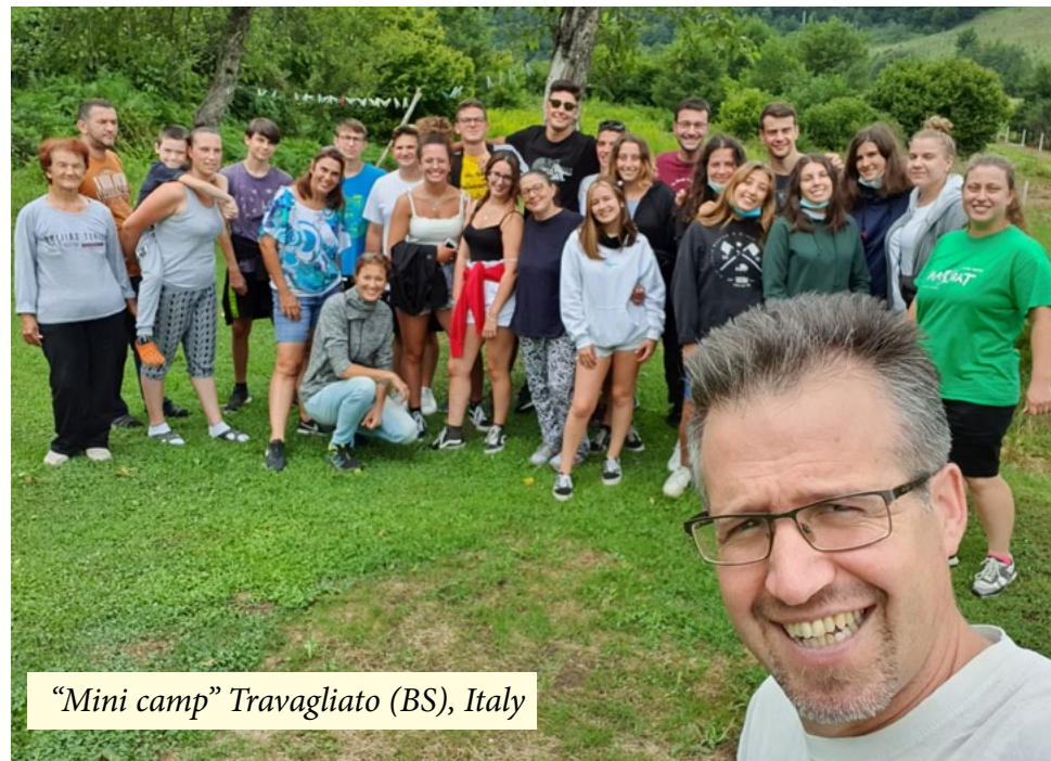
“Mini camp” Travagliato (BS), Italy