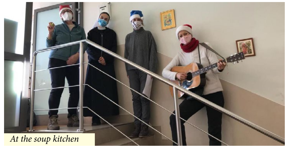
At the soup kitchen

During the month of December we continued to distribute aid packages to the needy families, and one of them even joined us for a Christmas lunch at our house. On the same day we also went to the center of Rijeka to distribute Christmas wishes and chocolates to lonely people and the homeless. The day after we went to sing Christmas carols to the beneficiaries of the Soup Kitchen in Rijeka.