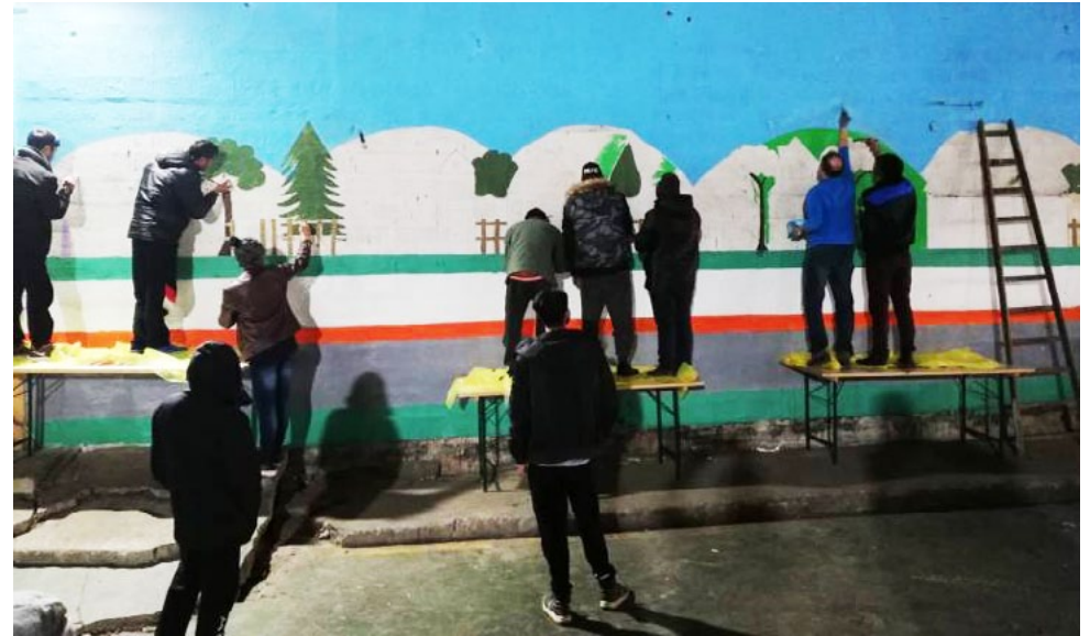
A mural at the Bira refugee camp

We spent the last week of February with a group of volunteers in Bihac , Bosnia, in cooperation with an organization called IPSIA. In order to be able to fit in all that we wanted to do, we often had to divide in two to three groups. One group painted various murals in the Bira camp, helped by the young people residing there. Another group did a mural at the children's hospital. We also did three shows : one for children and their families in the Borići camp, another one for the families in the Sedra